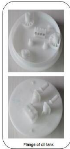
Flange of oil tank