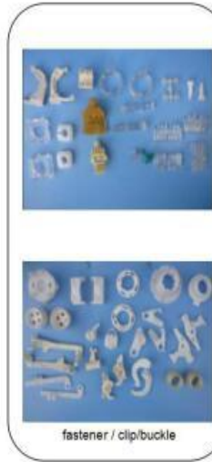
fastener / clip/buckle