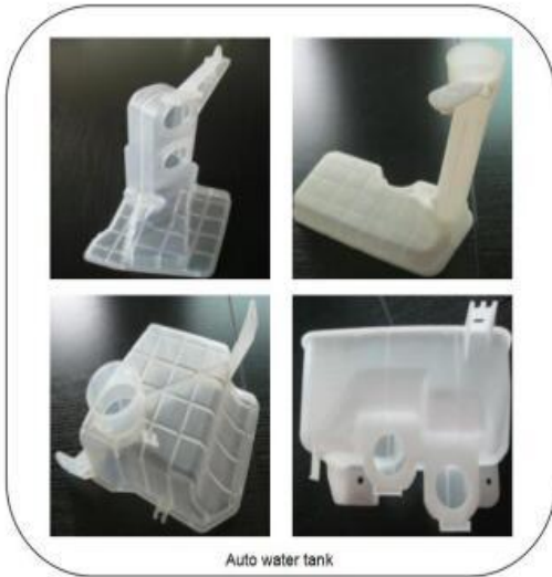
Auto water tank