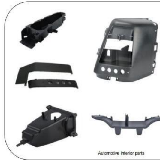
Automotive interior parts